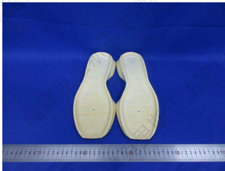
Figure 1 - Test sample