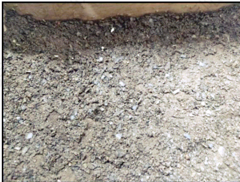
Figure 2 - Anaerobic microbial inoculum

The anaerobic digested sewage sludge (Figure 2) mixed with household waste was obtained from the Chembur (Mumbai). To make the sludge adapted and stabilized during a short post-fermentation at 53 °C, the sludge was pre-incubated (one week) at 53 °C. This means that the concentrated inoculum was not fed but allowed to post ferment the remains of previously added organics allowing large easily biodegradable particles were degraded during this period and reduce the background level of biogas from the inoculums itself.